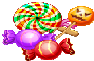
Limit foods that are high in sugar!

sugar, like honey, pancake syrup, jelly and jams, ice cream toppings, and chocolate syrup. Sugars are a form of carbohydrate, and starches are another form. Choose good sources of carbohydrates for you and your child. Good sources include: brown rice, whole grain cereals and breads, low-fat dairy products, and fruits and vegetables.